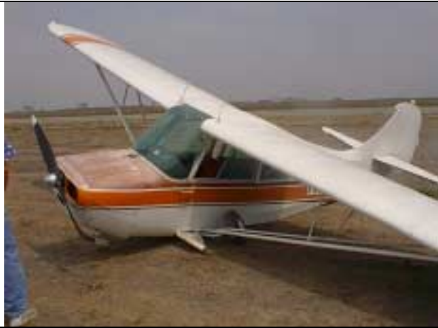
The Flying J Champ had a mishap during our monthly meeting; went thru a ditch that broke the left gear.

dinner with entertainment be had for $2.50????