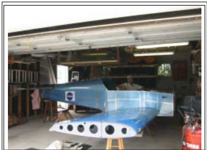
Dan Masys, whose article about visiting Oshkosh graced our pages last month, sent this picture of his RV7.

The new book, "Flying With the Fred Baron," has 30 true stories, 30 b/w photos, four sections, 202 pages, 5-1/2"x8-1/2" color softcover, $18. Further information, an excerpt, and ordering are available at www.booklocker.com/fredbaron .