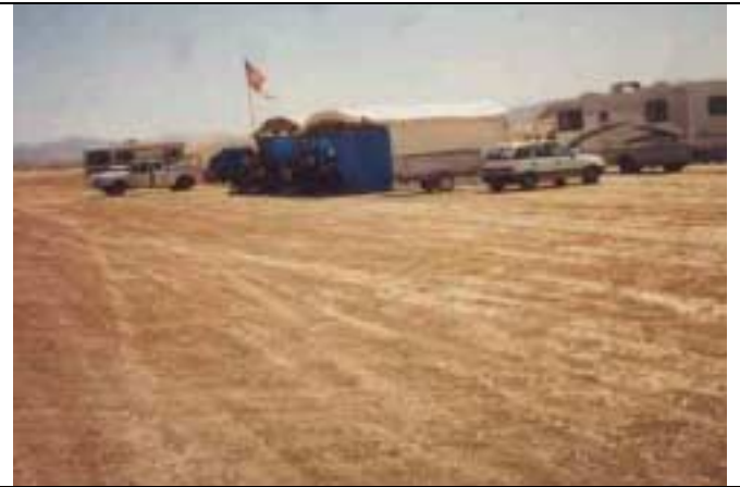
Ocotillo Wells Campout

To order an autographed copy send $29.95 to WFC PUBS, P.O. Box 9704, San Diego, CA 92169-0704