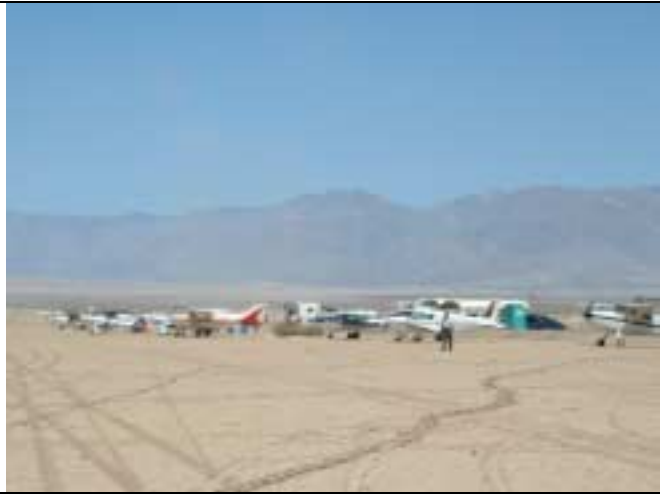
The flightline at Ocotillo

and invited us to fly in and display our homebuilt and antique aircraft on that date and receive a free dinner. The Oceanside Airport Association is in a long running battle with local interests to keep the airport open and hopes on that date to demonstrate to the local community the importance of the airport.