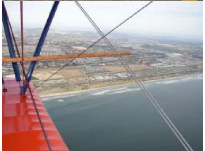
My wife and I celebrated Mothers' Day by taking a ride in a 1929 Travel Air biplane out of Palomar Airport.