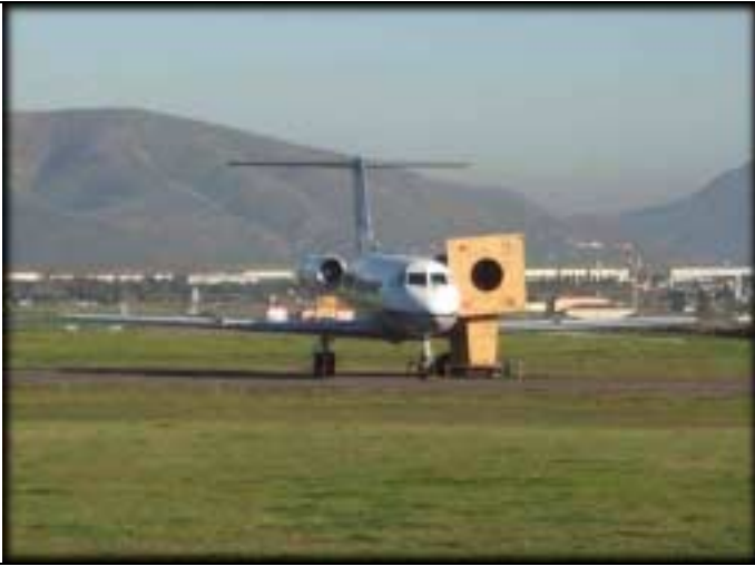
What's going on with this airliner at Brown Field?